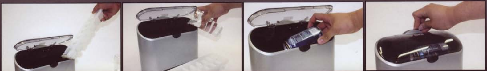
1. Add ice

Makes a great gift & is perfect for parties or entertaining when there is a high demand for cold beverages.