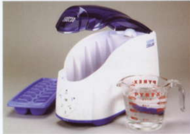
Step 1: Add Ice, Water and Plug In.