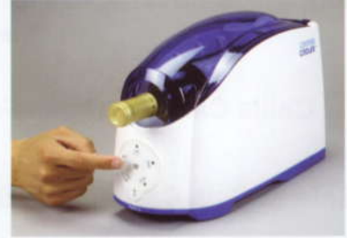
Step 3: Select Your Settings.