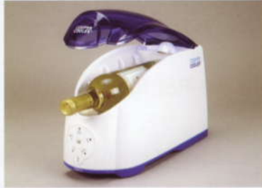
Step 2: Insert Your Beverage.