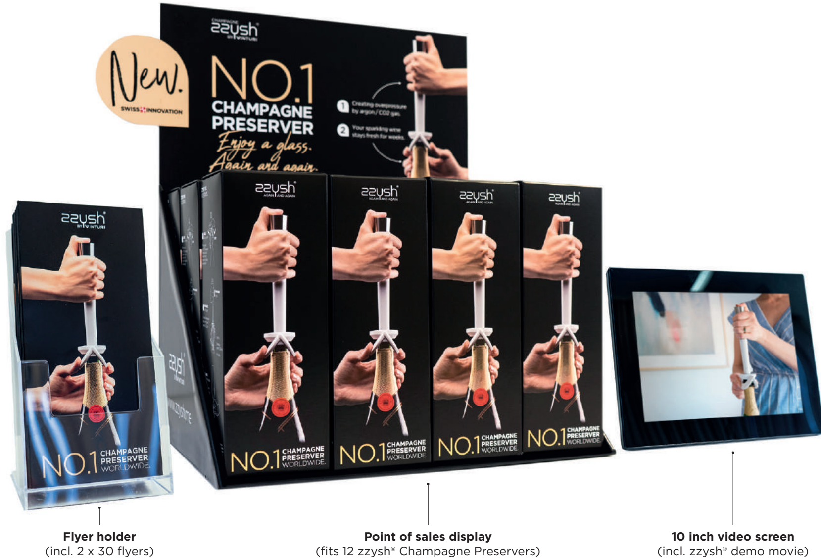
Flyer holder (incl. 2 x 30 flyers)

Create higher sales rates with the zzysh® Champagne point of sales display. It's designed to fit 12 zzysh® Champagne Preservers, guarantees best visibility in the store shelves and helps to achieve high sales rates.